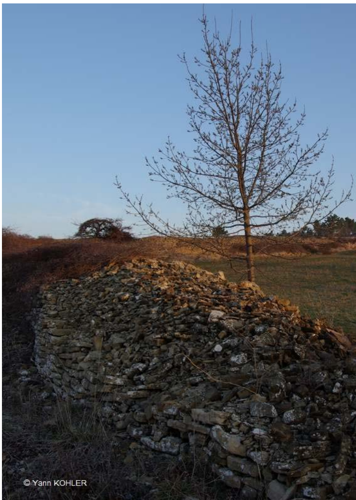
Photo 14: Rock fragment piles are important structural elements of the cultural landscape in some regions (see Measure 3.1.4)