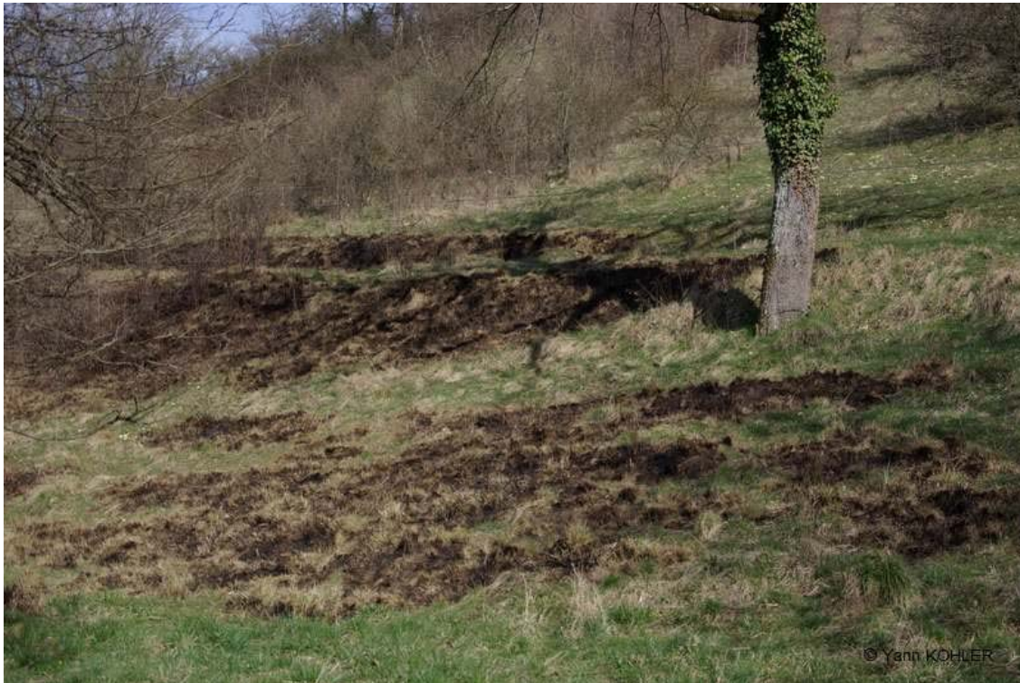
Photo 1: Targeted and expert “controlled burning” can help to preserve an open landscape (see Measure 3.2.3)