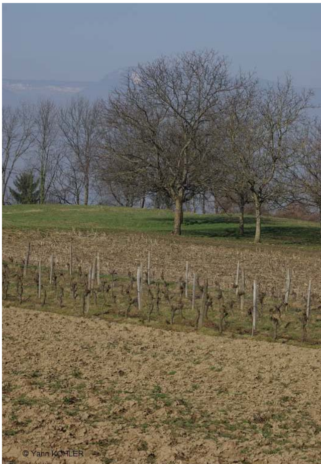
Photo 16: Small-scale parcels with various types of use form a diverse mosaic which creates an interesting landscape and promotes species richness.