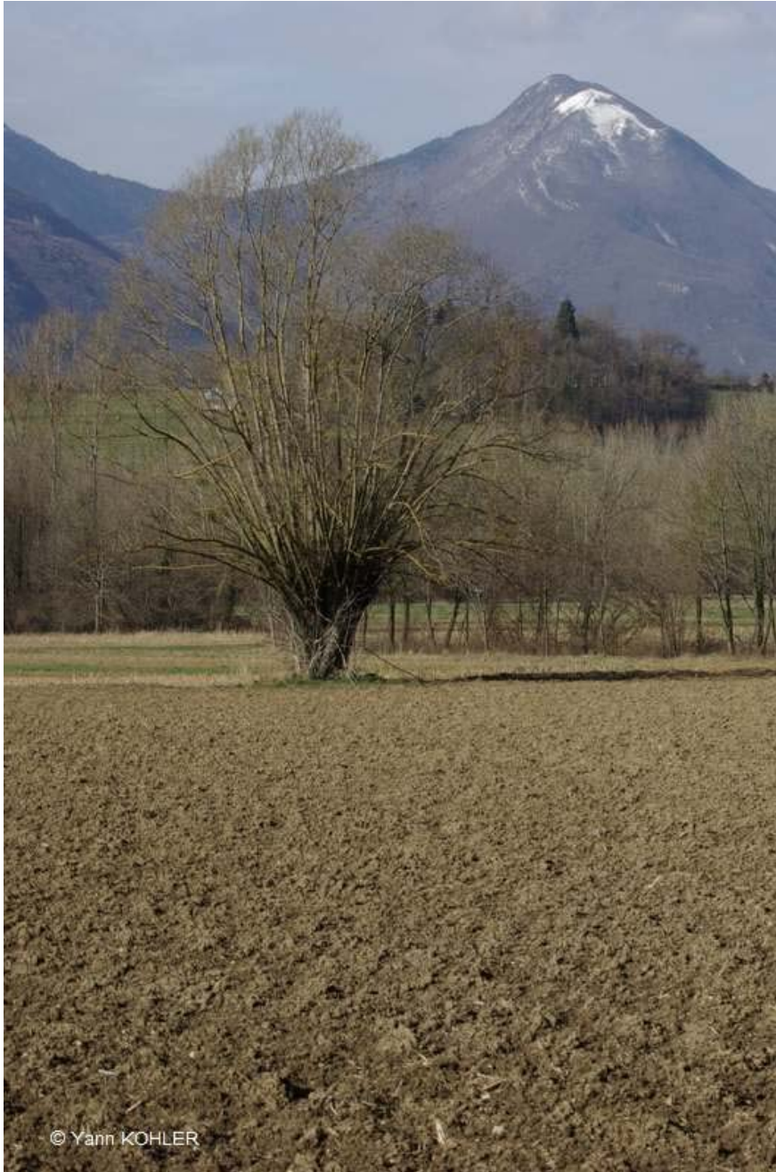
Photo 12: In agricultural landscapes, individual trees or tree groups act as stepping stones and transit routes, e.g. for birds and bats (see Measure 3.1.2)