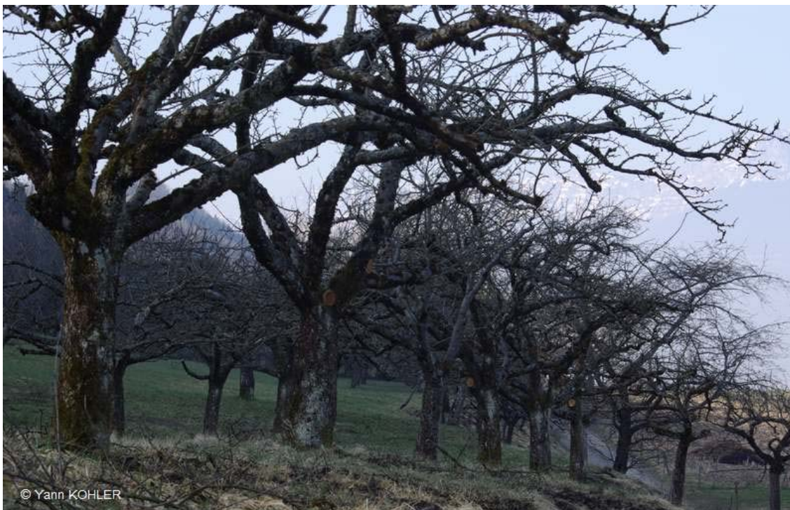
Photo 4: Mixed orchards are extremely species-rich habitats which require regular maintenance (see Measure 3.1.5)