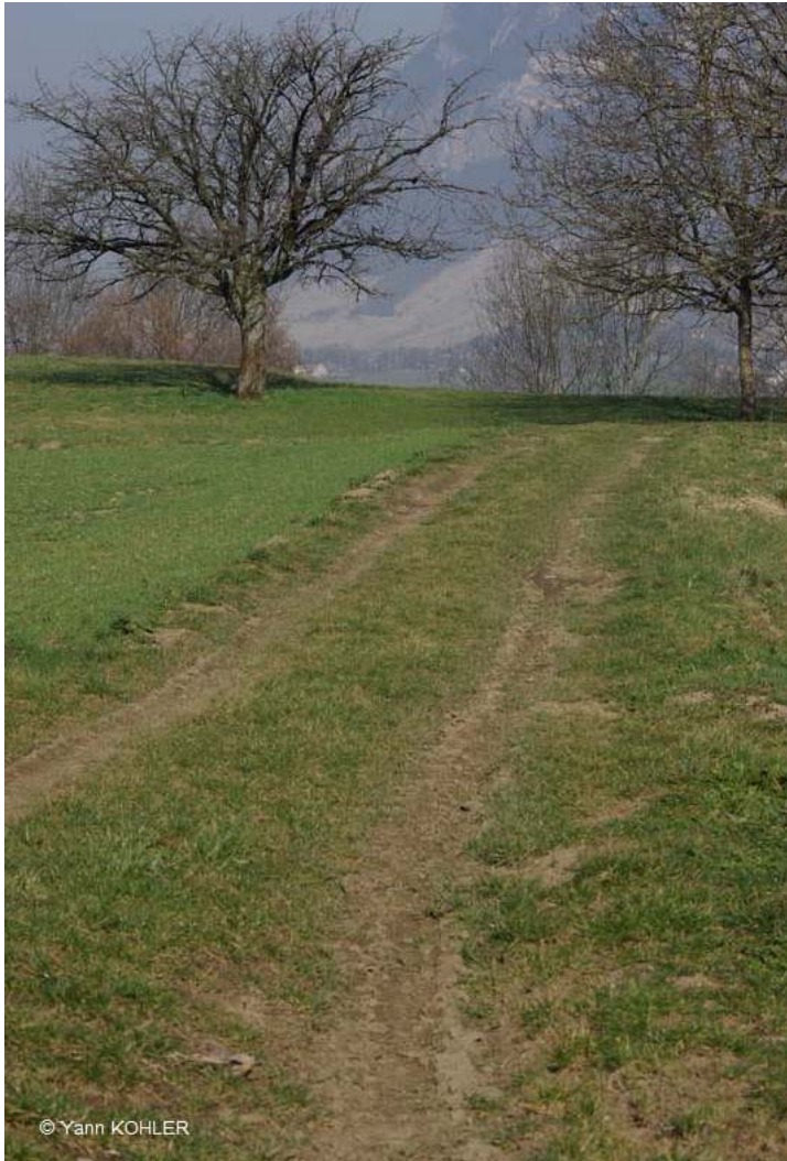
Photo 10: Unpaved, greened paths have a greatly reduced barrier effect (see Measure 3.1.6)