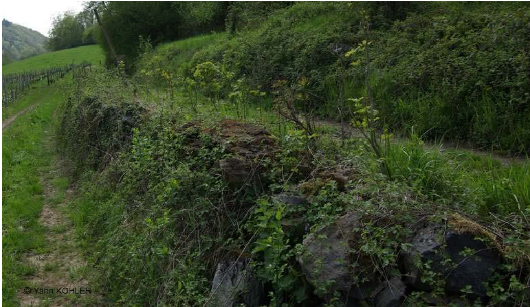
Photo 13: Walls made from rock fragments are important structural elements of the landscape (see Measure 3.1.3)