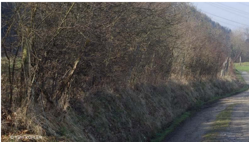
Photo 11: Hedges are linear connecting elements of the biotope network (see Measure 3.1.1)