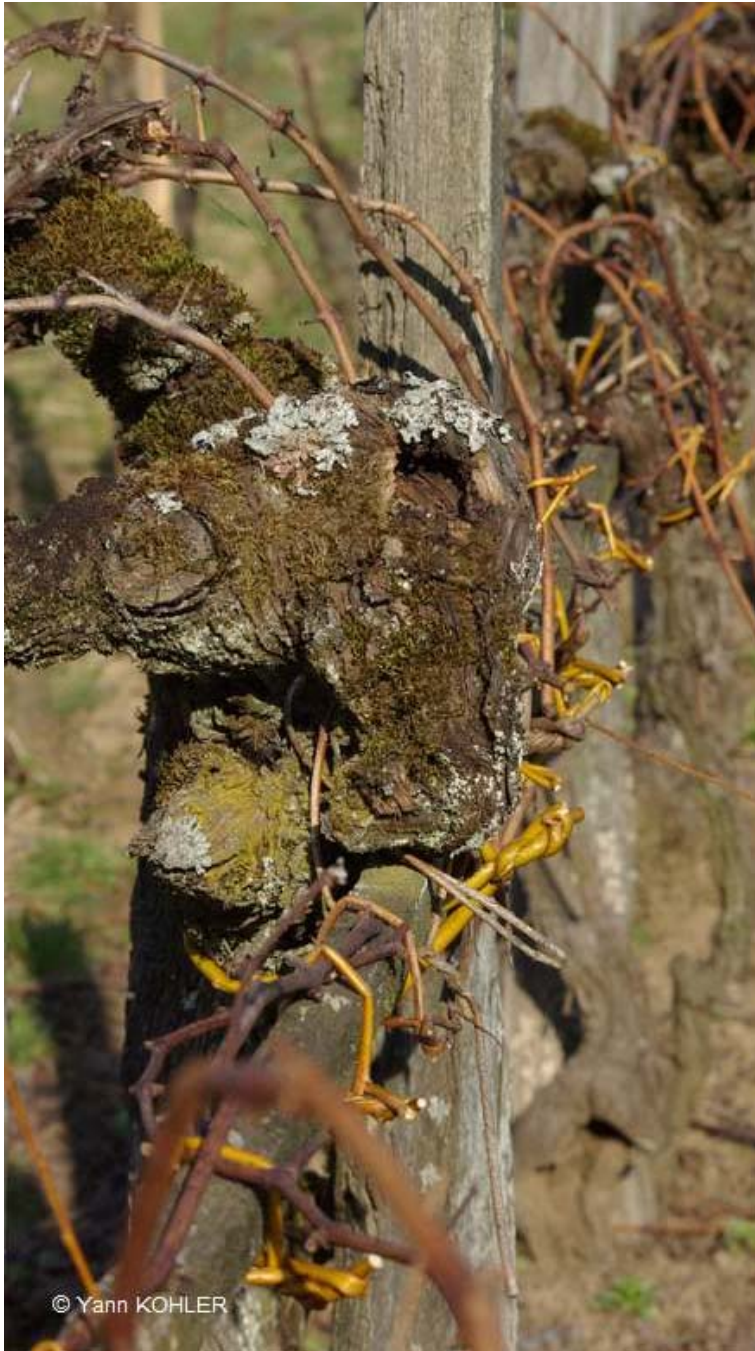
Photo 9: In some wine-growing regions, as here in French Savoie, viticulturalists traditionally tie up their vines with strips of willow (see Measure 3.2.4)