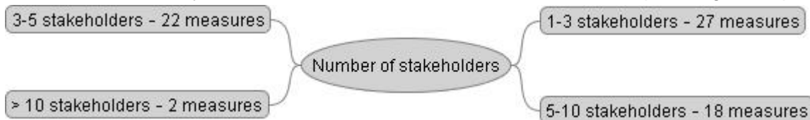
Figure 3 shows how many different stakeholders are involved in the measures contained in the catalogue.

In addition to the main stakeholders, however, numerous other stakeholders are also invariably important and are likewise in a position to support and promote ecological network measures. Indeed, in some cases, they play a critical role in terms of implementation and should certainly be involved in the planning process.