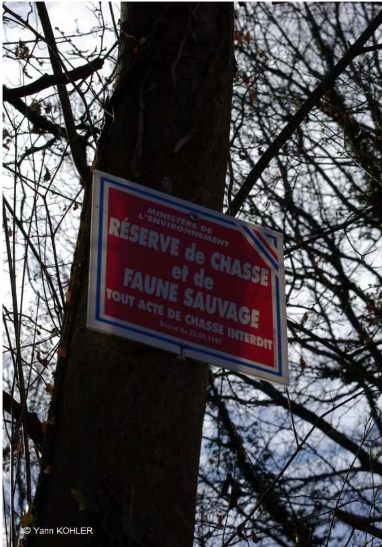
Photo 5: In French game reserves, hunting is strictly prohibited. Habitat improvements should also be carried out (see Measure 9.1.1)