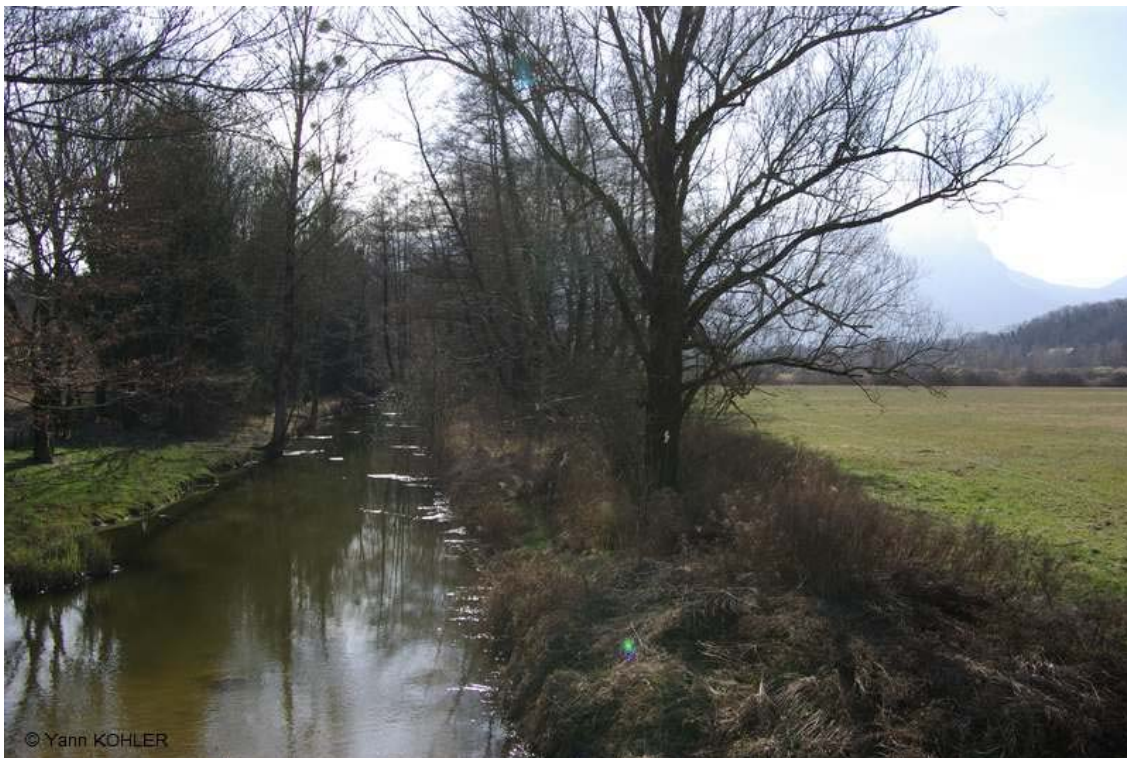
Photo 2: Riparian strips, at least 3-5 m wide, along flowing waters act as buffers and form linear connecting elements (see Measure 7.1.3)