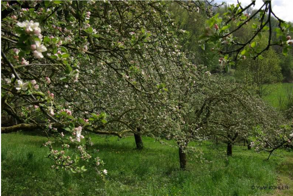
Photo 7: Mixed orchards act as stepping stone biotopes, especially if other landscape structures such as hedges are located nearby (see Measure 3.1.5)