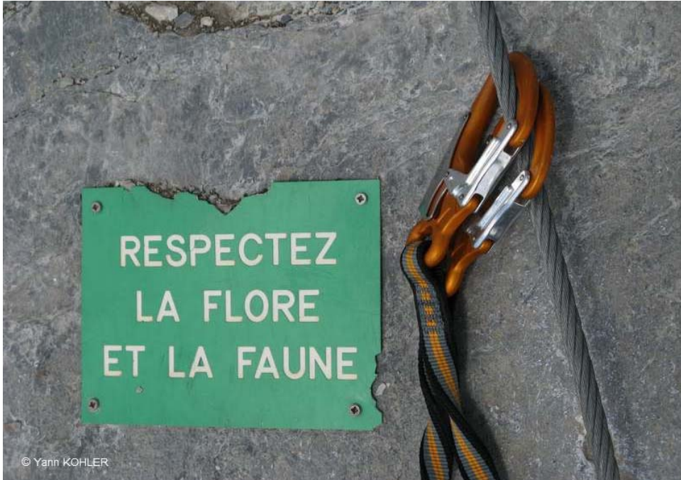
Photo15: Agreements with sportspeople can prevent disturbances in sensitive areas, e.g. on crags (see Measure 11.2.2)