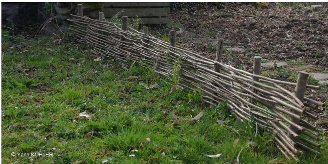
Photo 6: Willow rods are still used for various purposes today, e.g. as lattice fencing (see Measure 3.2.4)