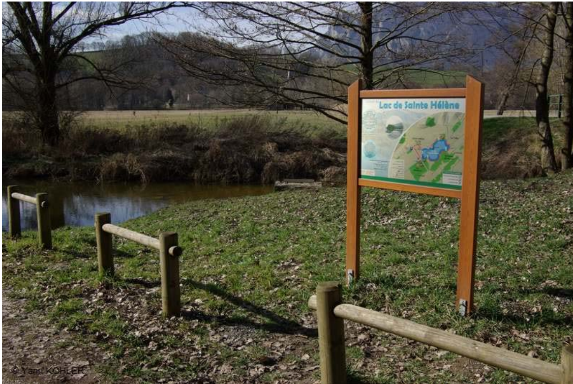
Photo 3: Signage, information boards and waymarking can channel visitors in sensitive areas and thus create quiet zones for flora and fauna (see Measures 11.2 and 4.1.2)